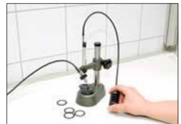
Probe positioning device