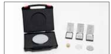
Calibration foil sets and reference blocks