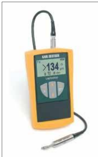
The LEPTOSKOP 2042: high-performance, up-to-date, affordable