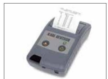
Mobile thermal printer