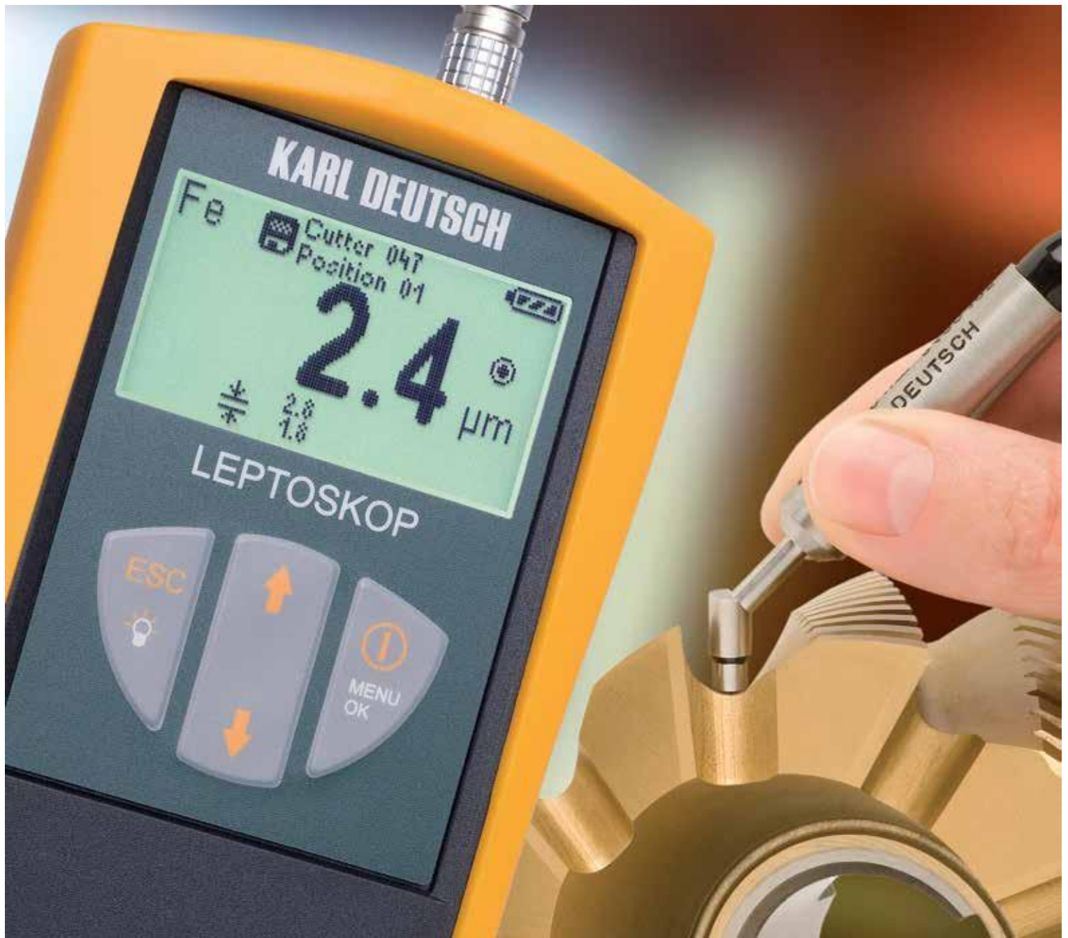
LEPTOSKOP® 2042 Coating Thickness Measurement