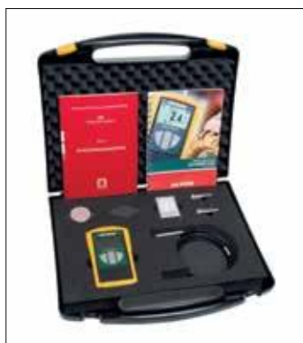
Practical carrying case provides enough space for extensive accessories

The brand name LEPTOSKOP® represents decades of experience in development of precise and reliable coating thickness measurement gauges from KARL DEUTSCH.