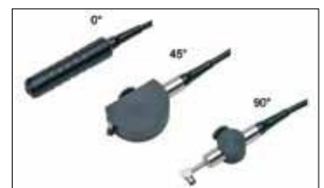
Positioning aid for micro probes