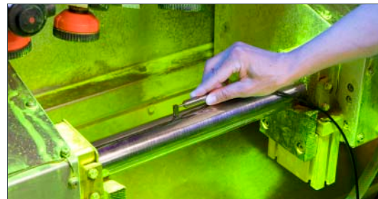
Example on application: Measurement of tangential field by means of the 90°-probe at field flow

For optimal adaptation to the geometrical conditions you can choose between a 0° and a 90°