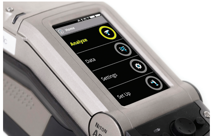
The Thermo Scientific™ Niton™ Apollo™ LIBS analyzer.