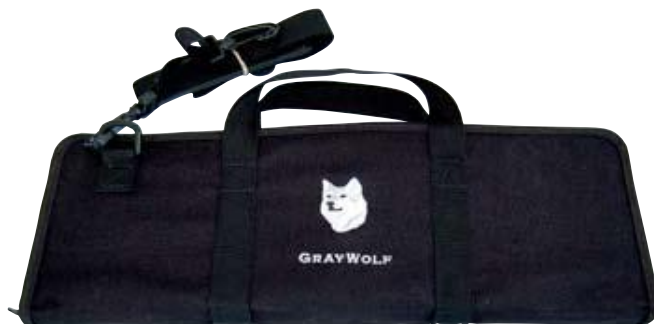
PCC-P504 Case (included with PIT-504-KIT)