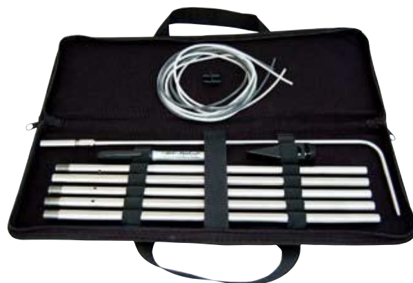
PIT-504-KIT (shown here with 2 optional extensions)

Available for use over an exceptionally wide air velocity and temperature range: airspeed testing up to 100 m/s (20,000 ft/m), at up to 800°C (1475°F).