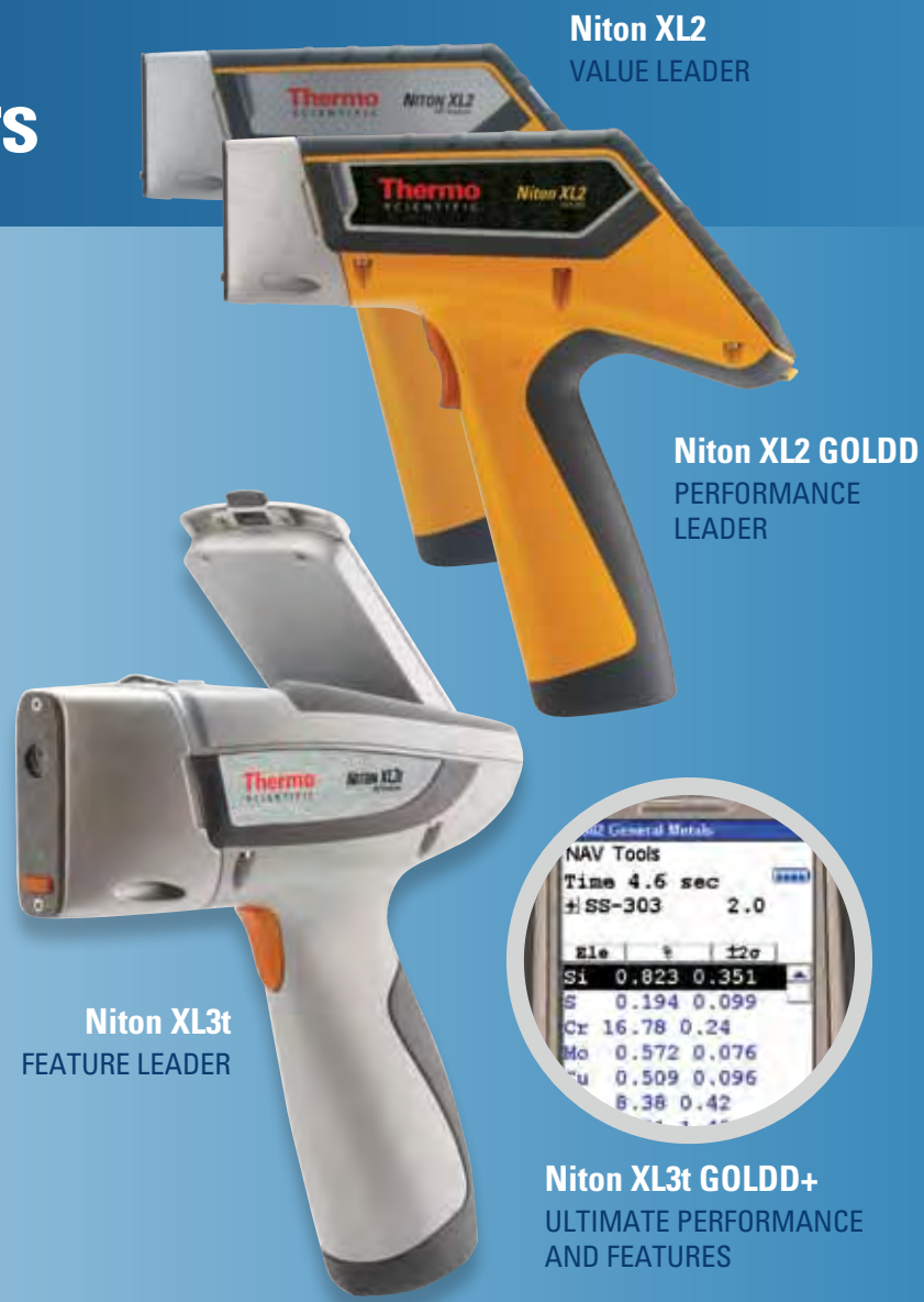
Niton XL2 VALUE LEADER

Bluetooth™ wireless and USB communications interfaces are included in every analyzer. Advanced Thermo Scientific Niton Data Transfer (NDT©) PC software lets you set user permissions, print certificates of analysis to document results, or operate the analyzer right from your PC.