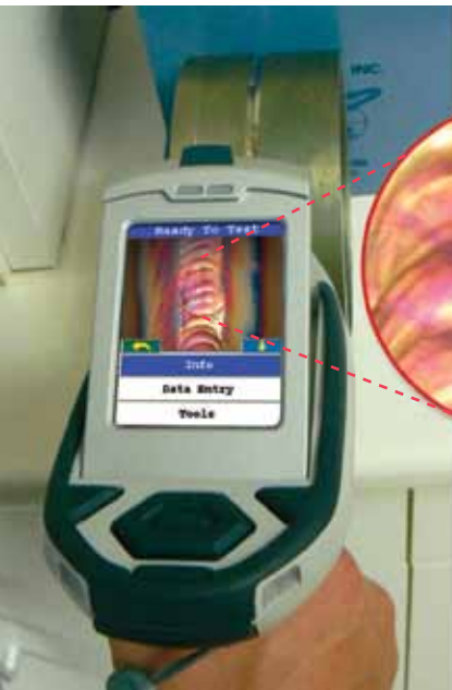
Optional CamShot and WeldSpot