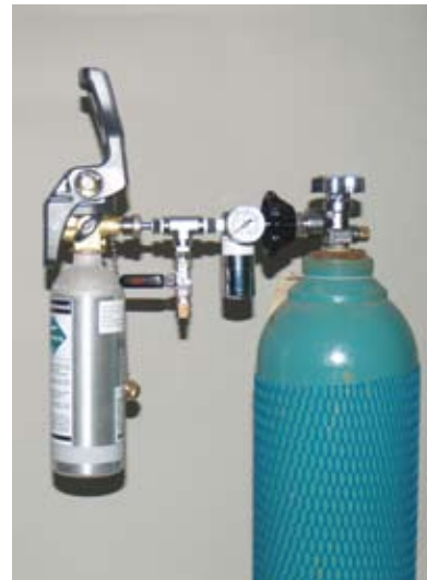
The lightweight, refillable helium tank with its ergonomically designed holster facilitates light element testing in the field. Large tank (shown) not included.

Portable Helium Tank – At 1.5 pounds, this refillable tank is designed for use with the Thermo Scientific Niton XL3t 900 Series analyzer to fill the interior of its unique measurement head with pure helium, purging atmospheric air from the x-ray analysis path and allowing light element x-rays to contact its high-resolution x-ray detector. The tank includes a preset flow rate valve and quick disconnect. Refill the helium tank to avoid consumable helium tank expenses. Along with the portable helium tank, you also get the ergonomically designed, cross body portable helium tank holster. It comfortably secures the 58 liter portable helium tank for in-field testing.