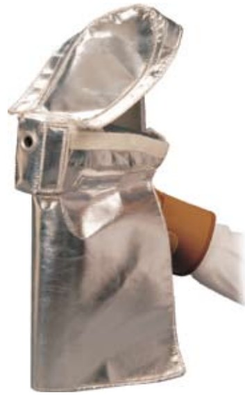
HotFoot™ Hot Surface Adapter protects both your hand and the instrument.

Heat Shield – Thermo Scientific HotFoot Hot Surface Adapter – Form-fitting heat shield protects your hand and the instrument from elevated temperatures associated with in-service Positive Material Identification (PMI) testing. It extends testing capabilities to 1000° F (500° C).