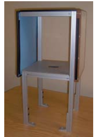
The benchtop test stand's leaded glass shielding provides full view of the test chamber while guarding against radiation exposure.

Portable Test Stand – This lightweight (6 lb.) ultra-portable option is ideal for field use, especially in remote locations or when you want to analyze small samples without connecting your computer to the Niton XL3. Interior dimensions are 5.5 inches by 2.63 inches by 2 inches (13.97 cm x 6.67 cm x 5.08 cm).