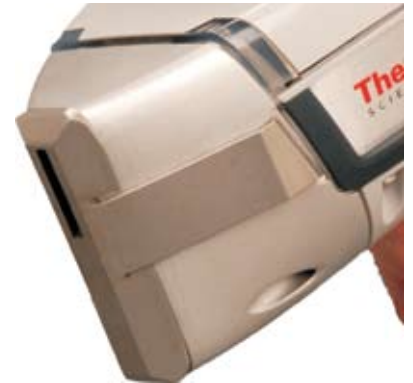
The clip-on weld mask narrows the test window to 3 mm, isolating weld beads from joined pieces.

Weld Mask – An optional clip-on weld analysis mask narrows the test window to 3 mm, permitting isolation of weld beads from joined pieces for analysis and verification of material composition and proper dilution rate. It is ideal for analyzing all types of weldments, including fillet welds. (For alloy analysis applications only.)