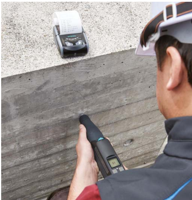
Original Schmidt Live Print with Bluetooth printer