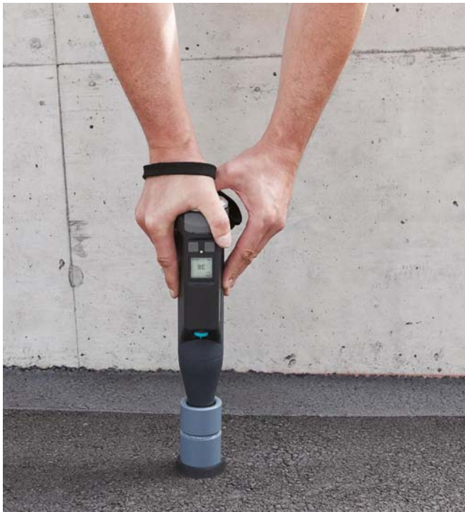
Original Schmidt Live with portable testing anvil