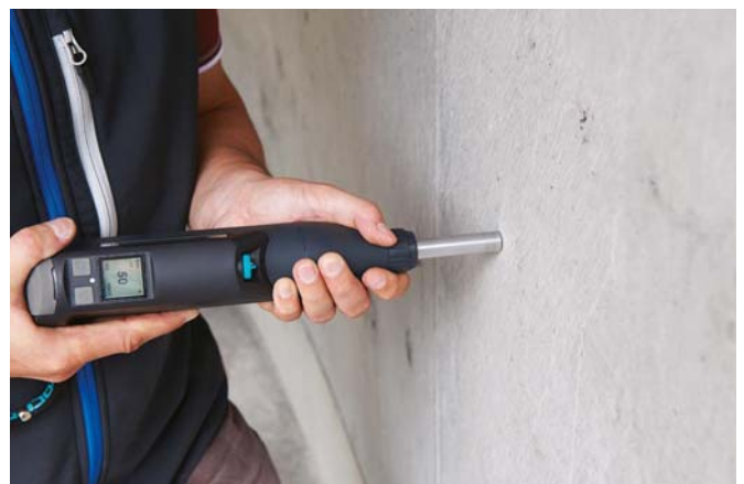
Original Schmidt Live with digital display