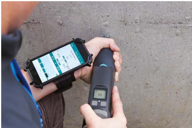
Original Schmidt Live with iOS app