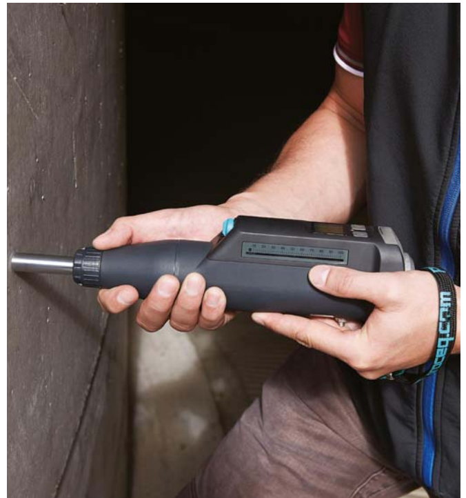
Original Schmidt Live with wristband

When acquiring a new instrument, max. 3 additional warranty years can be purchased for the electronic portion of the instrument. The additional warranty must be requested at time of purchase or within 90 days of purchase.